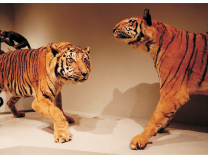
Zoology Museum http://www.mz.usp.br/