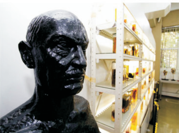
Museum of Geosciences http://www.igc.usp.br/museu