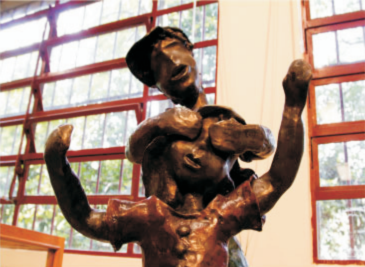
Museum of Human Anatomy www.icb.usp.br/museu