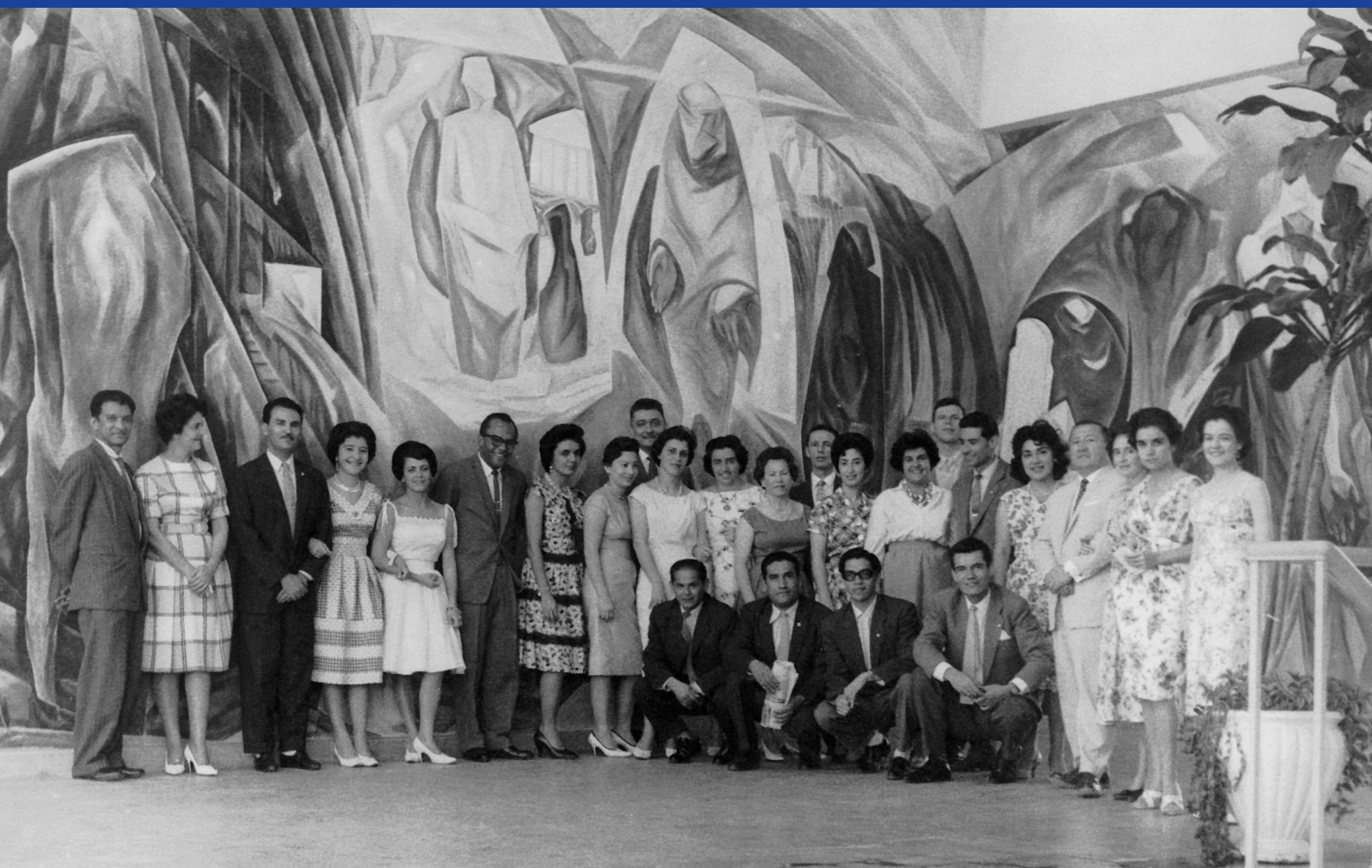
1960's - students of the continuing education course at the former CRPE

the reception of the School of Education at the University City in 1962. The CRPE was dedicated to practice and experimentation of educational innovations in primary school. It kept experimental classes that later gave birth to the Lab School (School of Application). The College of Application was terminated in 1969. The Lab School gradually incorporated other levels of education and it has now elementary and high school classes. The CRPE gradually joined the School of Education, denomination that emerged only in 1969, under the University Reform.